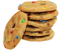
USO Cookies due April 9th

Winter is over and April is here. Time for the UMW to awake from its winter slumber. Activities start on April 9th. We once more will join with Church Women United to provide cookies for the USO. Purchased cookies are acceptable but home-baked ones are preferred. Please put the home-baked cookies in zipper freezer bags and mark the type and the number of cookies in each package. Our young men and women who are protecting us will appreciate your thoughtfulness.